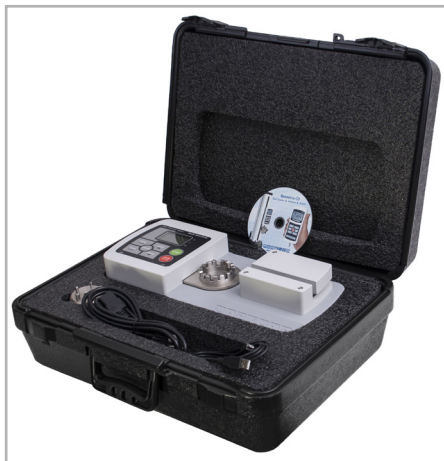
WT3004 Carrying case Provides storage space for the WT3-201M tester, optional ring terminal fixture, power cord, USB cable, and accessories.