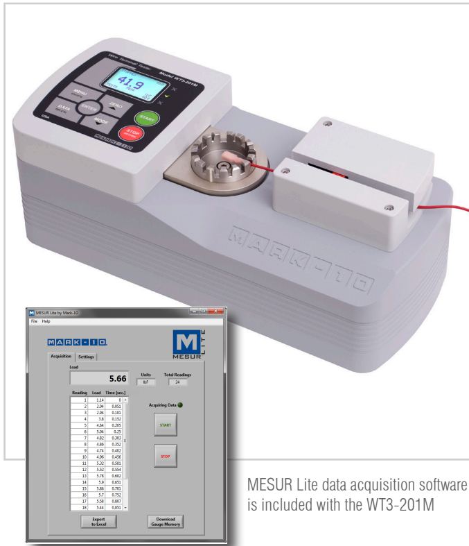
MESUR Lite data acquisition software is included with the WT3-201M

The WT3-201M motorized wire crimp pull tester is designed to measure pull-off forces of up to 200 lbF [1 kN] for wire and tube terminations. The tester conforms to numerous UL, ISO, ASTM, SAE, MIL, and other requirements for destructive testing. Non-destructive testing is also possible, such as pulling to a load or maintaining a load for a specified period of time, as per the requirements of UL 486A/B. Programmable pass/fail limits with red and green indicators and audio alerts help identify non-conforming samples.