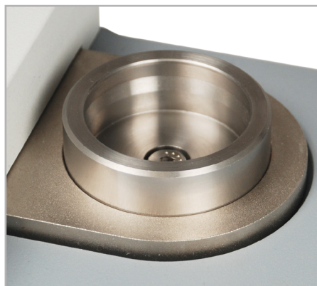
WT3003 Machinable blank terminal fixture For unique sample shapes and sizes.