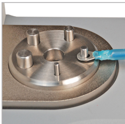
WT3002 Ring terminal fixture Secures ring terminations. Pin diameters from 1/8 to 3/8 in [3.2 to 9.5 mm].