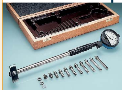
SUBITO SU 50 - 100