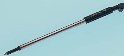
Measuring depth extension MTV