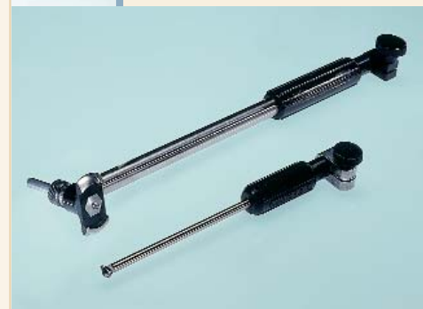
SUBITO SU 4,5 - 6 and SU 35 - 60