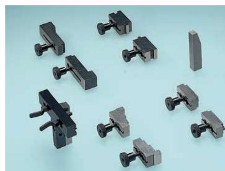
ESU accessories setting jaws/ measuring anvil