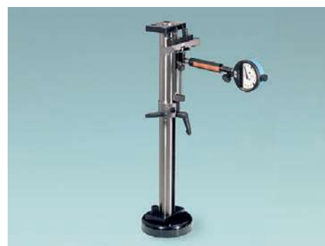
ESU Setting Device with vertical measuring axis