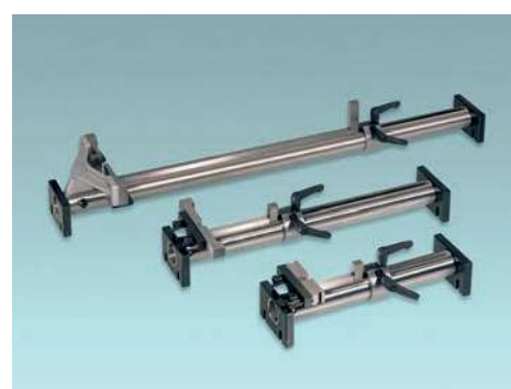
ESU Setting Device 510/290/160 with horizontal measuring axis