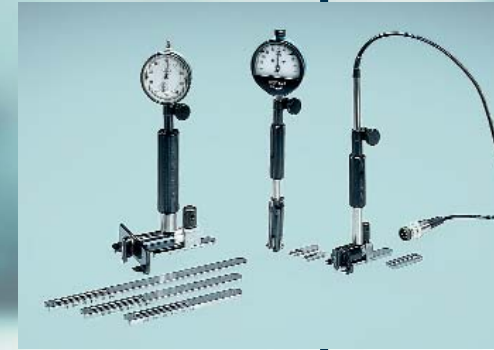
SUBITO SS for blind bores