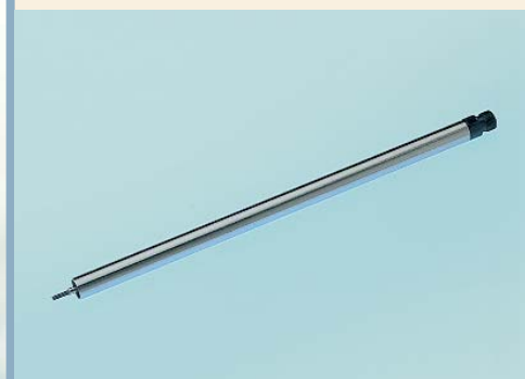
Measuring depth extension MTV for SV/SVS