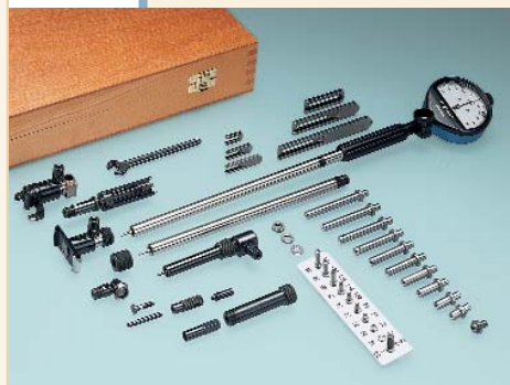
SUBITO Vario System SVS