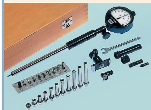
SUBITO Vario SV

Delivery SVS: as Series SV, but with a short upper part and additional measuring heads and slides for blind bores. As well as an angle piece 90° for difficult-to-reach bores and 2 measuring depth extensions 192 mm; in wooden box, w/o dial gauge.