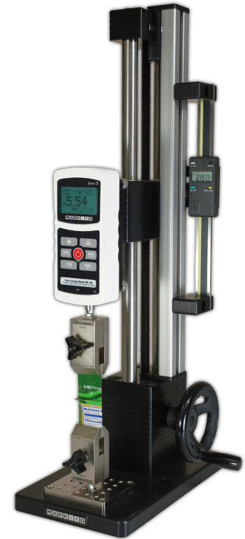
The ES30 is shown in a typical compression testing application, with Series 5 digital force gauge, digital travel display, and attachments