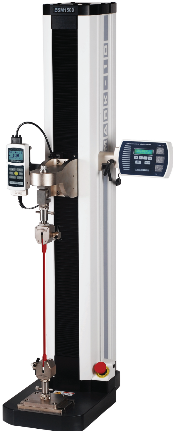
^ ESM1500LC is shown above configured for a tensile test, with a Series R01 force sensor, Model 7i indicator, G1061-2 wedge grips, and eye end adapters.

The ESM1500 is a highly configurable single-column force tester for tension and compression measurement applications up to 1,500 lbF [6.7 kN]. Suitable for laboratory and production environments, the ESM1500 may be used with an indicator-load cell combination or with a force gauge. Sample setup and fine positioning are a breeze with available FollowMe™ force-based positioning - using your hand as your guide, push and pull on the load cell or force gauge to move the crosshead at a dynamically variable rate of speed.