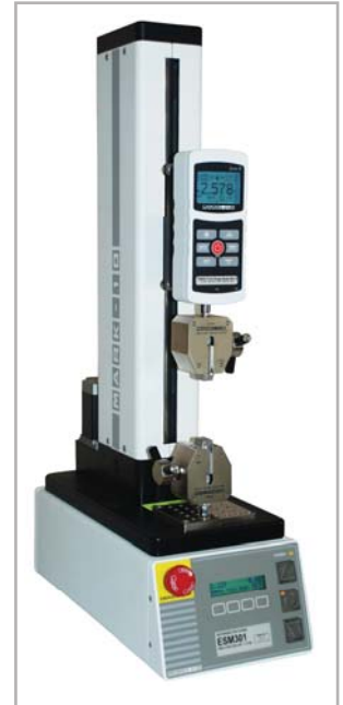
Shown with an ESM301 test stand and G1061 wedge grips

The Series 5's averaging mode addresses the need to record the average force over time, useful in applications such as peel testing, while external trigger mode makes switch activation testing simple and accurate. An ergonomic, reversible aluminum design allows for hand held use or test stand mounting for more sophisticated testing requirements. Series 5 force gauges are directly compatible with Mark-10 test stands, grips, and software.