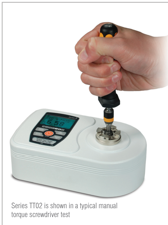
Series TT02 is shown in a typical manual torque screwdriver test

Series TT02 Torque Tool Testers present a simple and accurate solution for testing manual, electric, and pneumatic torque screwdrivers, wrenches, and other tools. These testers are compact and rugged, suitable for production environments. A universal 3/8" square receptacle accepts common bits and attachments. The TT02 captures peak torque in both measurement directions, and also calculates 1st and 2nd peaks, useful for click-type tools.