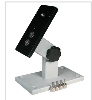
^ Optional AC1008 tabletop mounting stand