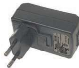
AC Adapter (P.47)